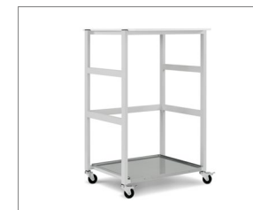
Stack on stacking frame with casters